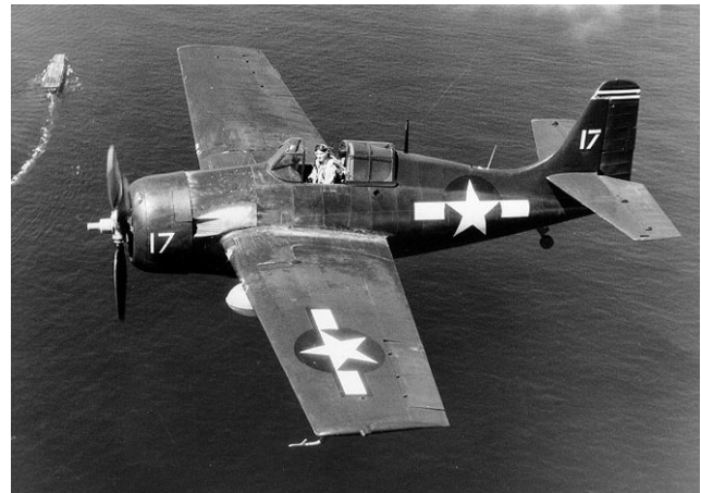
An FM-2 Wildcat over the Western Pacific in 1944.